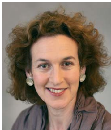
Gillian Merron MP Parliamentary Under Secretary of State for the Department for International Development

A handwritten signature in black ink that reads "Dawn Primarolo".