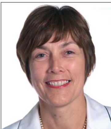
The Rt. Hon. Dawn Primarolo MP Minister of State for Public Health, England

shows that we are doing much already, but we can do more. For example, we highlight significant opportunities for healthcare professionals, the NHS and other institutions to participate in international development. We believe that the framework and approach set out in this paper will bring greater clarity and coherence to the way that the 'UK health economy' contributes to positive results. This paper also demonstrates the importance of working across government to pursue international development objectives and supports the case for investing in global health.